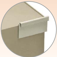
QTB-LP-BKT Hanging Bracket for Tip Out Bins