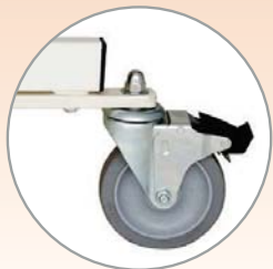
All Starter and Add-On Units can be made mobile