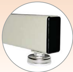
All Starter and Add-On Units come standard with Leg Levelers