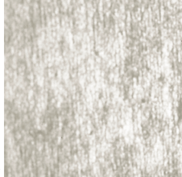
7000 Series magnified colored to show detail

allows the printer's vacuum system to work as designed, but also makes it an ideal roll for printers that have not been upgraded with a vacuum system. Because of its lighter basis weight, it accommodates additional linear feet per roll while maintaining the standard roll OD specification. Rolls made from the OmniRoll material begin with "7", i.e., part number 7101MP represents an MPM roll made with the 7000 Series, while part number 7101MP-55 has 55 linear feet of material instead of the normal 39 feet for a standard MPM roll.