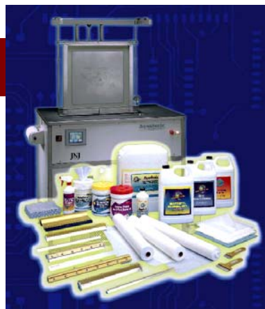
SMT PRODUCTION SUPPLIES & CLEANING EQUIPMENT CUSTOM & PRODUCTION MACHINING

Our commitment is not only to provide the highest quality understencil rolls possible, but to make them available to you for fast delivery through a network of local, national and international distributors. In addition to getting JNJ quality products, you add the benefit of doing business with local suppliers who can provide quick delivery and familiar service.